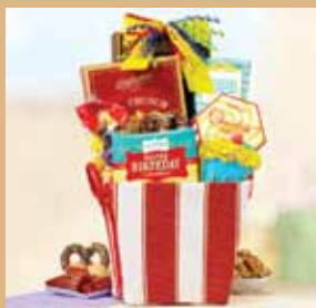
Birthday Delight 97791