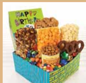
Great Big Happy Birthday Sampler 97875