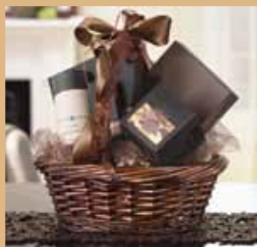
I'm Just Wild About Harry London BN891G