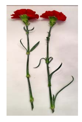
Remove any foliage from stem that will be under water