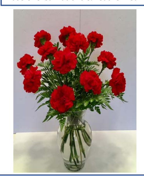
Side View Vase of 12 Carnations & Leather Leaf