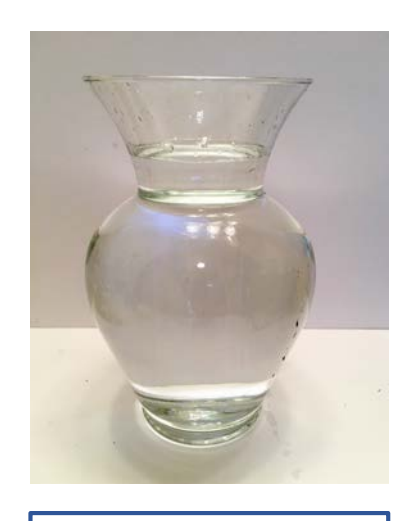
8 ¾" tall vase