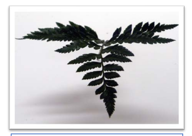
Enter from front center toward focal point