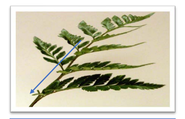
Enter from right side toward focal point