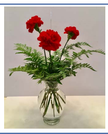
Vase of 3 Carnations & Leather Leaf