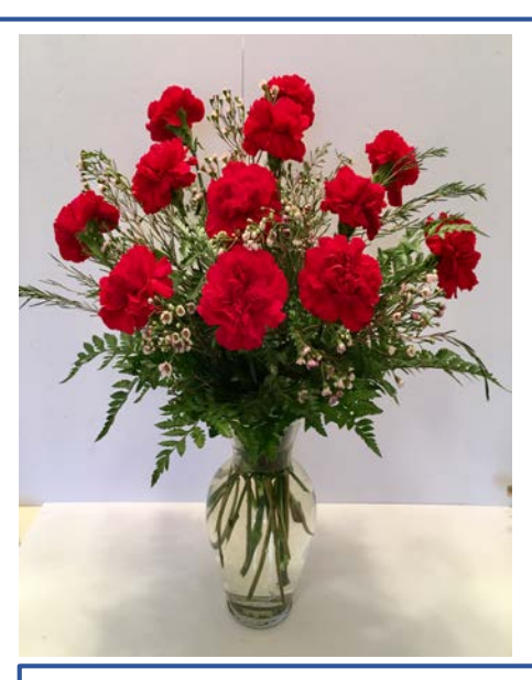
Side View Vase of 12 Carnations, Leather Leaf & Wax Flower 11