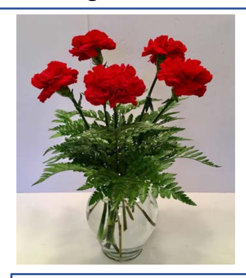
Vase of 5 Carnations& Leather Leaf