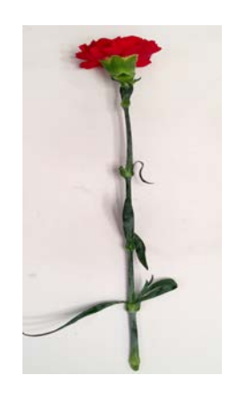
Stem Length should be approximately 20"