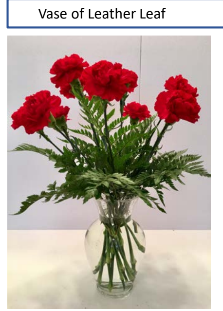
Vase of 8 Carnations & Leather Leaf