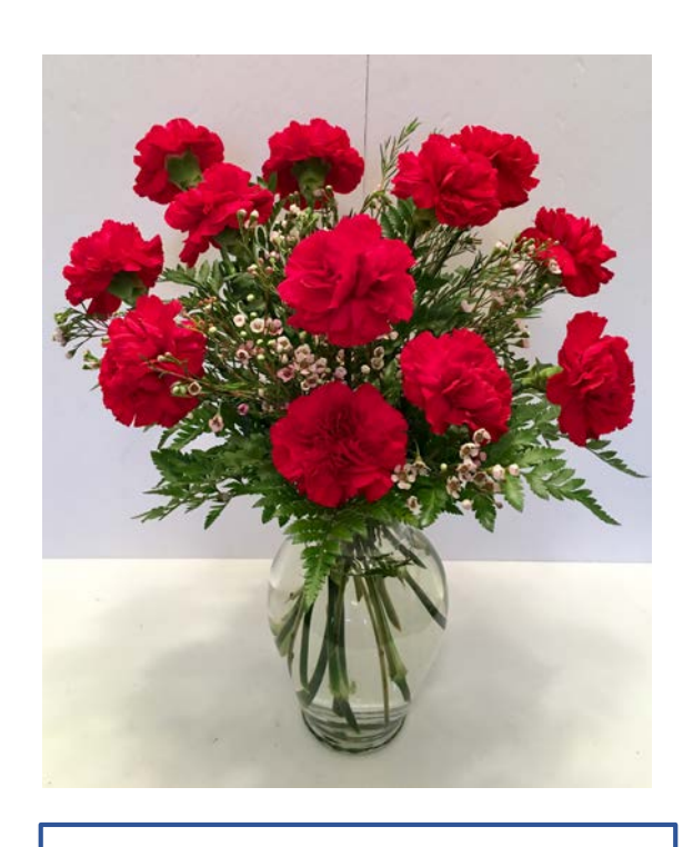
Dz Carnation Arrangement