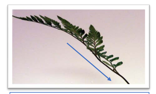
Enter from left side toward focal point