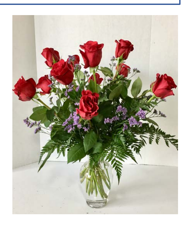
Dz Rose Arrangement