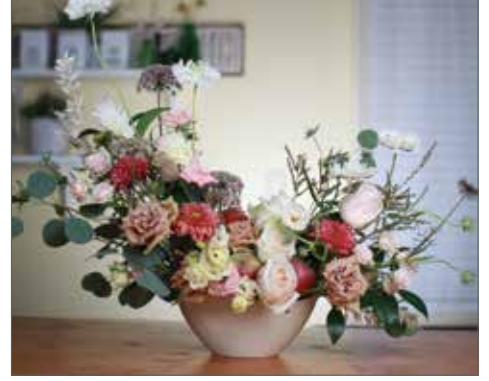
Design Credit | Donald Yim AIFD PFCI