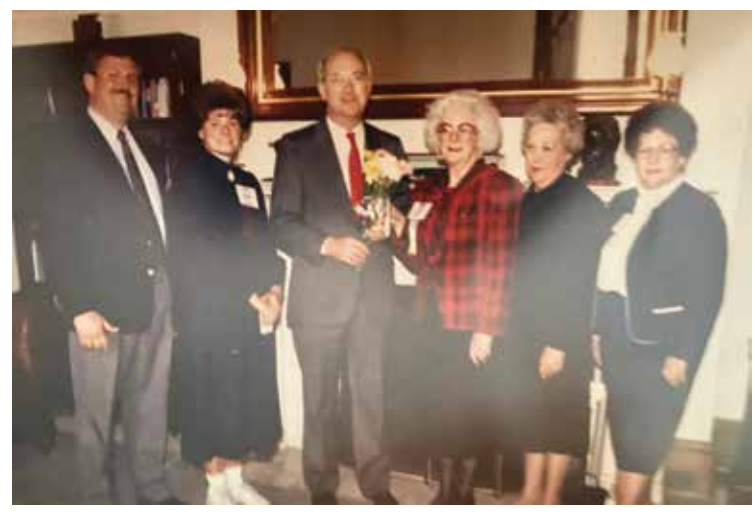
Visiting the offices of Senator Phil Graham of Texas during SAF Congressional Action Days.